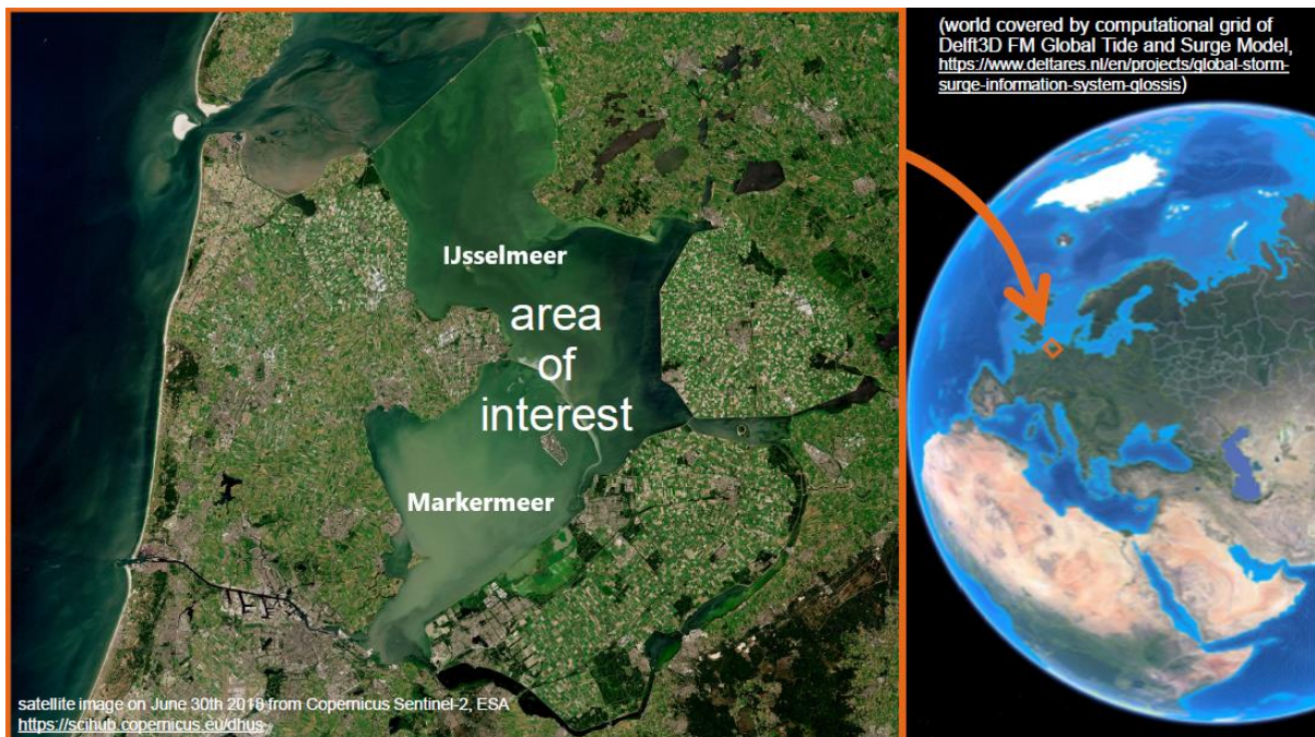
Figure 1 Location of the IJsselmeer area, showing the IJsselmeer itself in the northern part of the system and the Markermeer in the southern part.

We have chosen the IJsselmeer area as the primary site for this pilot. The IJsselmeer area (Figure 1) is an important site to study (reverse) eutrophication and habitat changes on biodiversity because 1) parts in this area have high concentrations of suspended sediments (Markermeer), 2) a shift took place from a lake, dominated by harmful algal blooms, to less harmful algae and 3) many restoration measures have been undertaken or are still in construction such as the Marker Wadden (part of the to be constructed national park Nieuw-Land). The IJsselmeer area is a freshwater lake area divided into three sections: 1) the IJsselmeer itself, 2) Markermeer/IJmeer and 3) Border lakes. All three are Ramsar and Natura 2000 sites. With the closure of the Afsluitdijk in 1932, the former Southern Sea estuary was transformed into the freshwater Lake IJsselmeer. Subsequently, a string of so-called border lakes and Lake Markermeer were created by land reclamation projects and the construction of dams. These alterations serve safety, provide drinking water supplies, and created agricultural land. Owing to the change in category, the lakes are “heavily modified” according to the definition of the Water Framework Directive (WFD).